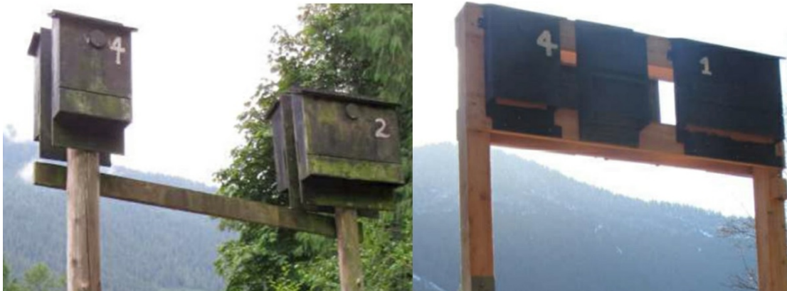
An old cluster of maternity boxes (left) has been repaired and upgraded.

Bats in the Clowhom River Watershed will benefit from 45 newly installed bat houses. A cluster of maternity boxes, which has been used by more than 600 bats, has been repaired and upgraded. This work will help ensure the survival of bats and their habitat in the watershed and surrounding communities. MORE.