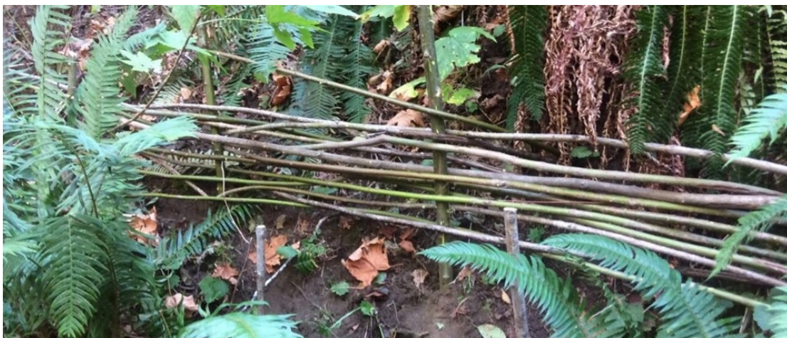
Sites identified to have steep eroding banks were treated with wattle fences.

Eroding banks along Cold Creek near Campbell River are being stabilized with woven fencing, live stakes, and newly planted western hemlocks. Twelve sites, covering nearly 600 square metres have been treated through a project led by A-Tlegay Fisheries Society. The full report is now available. MORE.