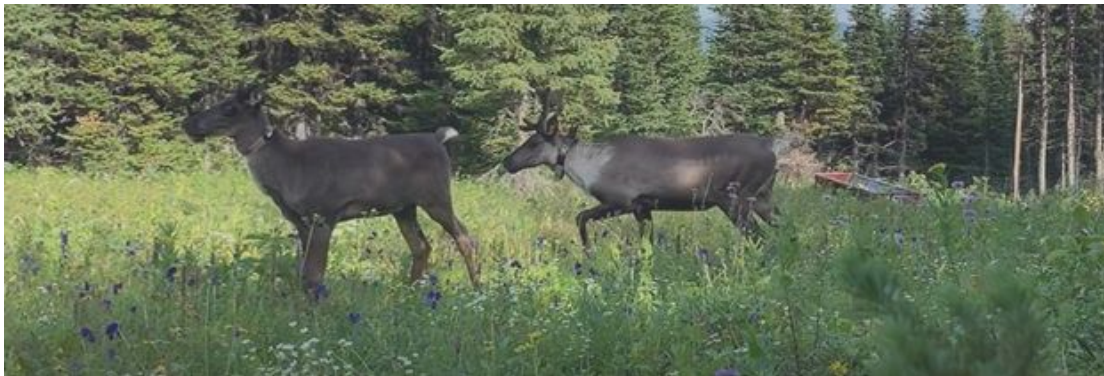
A calf (left) and cow eating fresh vegetation immediately outside of the pen.

Eight endangered caribou calves, 13 adult females, and one yearling were successfully released from a secure maternity pen in late August. Shepherds from the Saulteau and West Moberly First Nations start guarding the pen, which is located near Chetwynd, as soon as the pregnant cows are captured in early spring. The calves and cows are released from the secure pen when the youngest are large enough to be less susceptible to predation. The FWCP is a funder of improving caribou calf survival through maternity penning to recover the endangered Klinse-Za/Scott East herd.