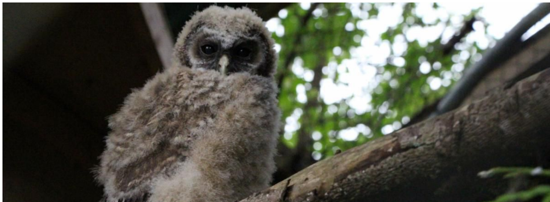
Chick "F", taken in June of this year. Looking for a name!

It's a boy! Chick "F" was one of the first chicks to hatch this past breeding season and helped the Northern Spotted Owl Breeding Program (NSOBP) get into gear for the busiest breeding season yet. He was the star of our nest webcam and was raised by foster parents Skalula and Oregon. Now he needs a name of his own. Suggestions need to start with the letter "F" and can be submitted on the NSOBP Facebook page: facebook.com/nsobreedingprogram .