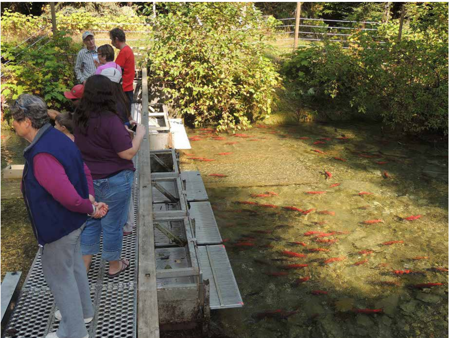
The FWCP Hosted an Open House at Meadow Creek Spawning Channel at the north end of Kootenay Lake in fall, 2015.

This Annual Report provides an overview of the activities of the FWCP-Columbia for Fiscal Year 2016 (i.e. April 1, 2015 to March 31, 2016), including a report on financial performance, project funding summary and project lists, alignment of the year's work with strategic objectives, as well as highlights from the year.