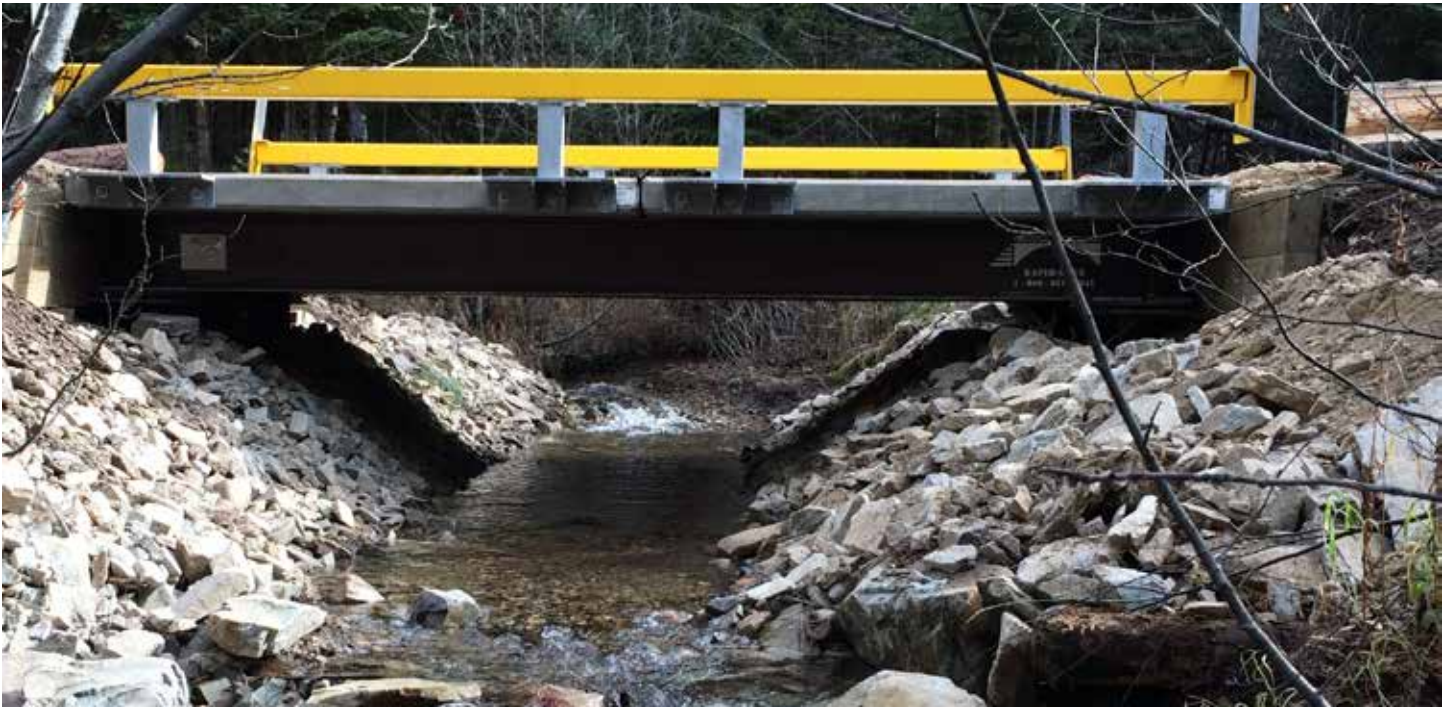
FWCP helped fund a new bridge, replacing a hanging culvert that was acting as a fish barrier, at Wickman Creek.