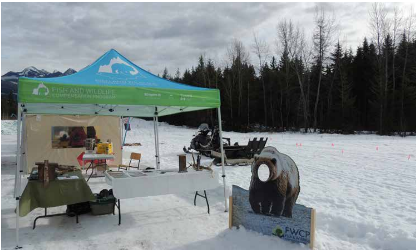
FWCP display set up at Kaslo Winter Fest in February 2016.