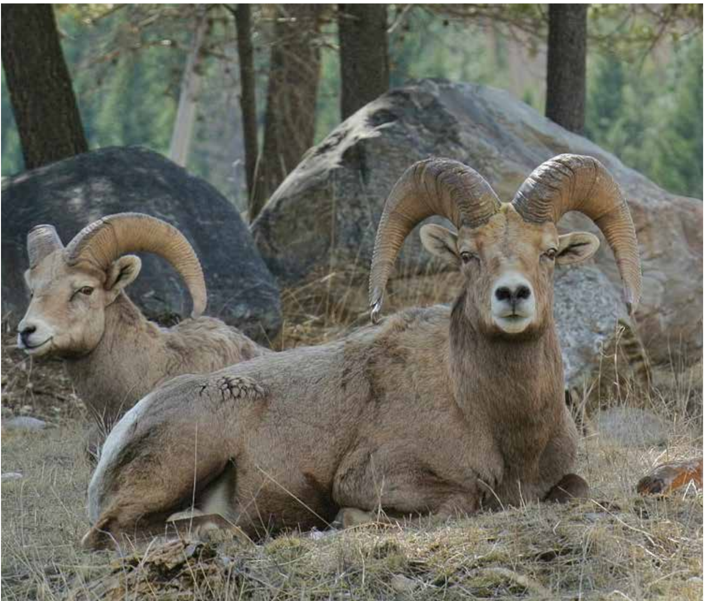
Rocky Mountain Big-horn Sheep, East Kootenay.

All projects developed for F16, including both core and grant application projects, align with the Basin Plan and Action Plans. The Plans are posted on the FWCP website, and, each year, applicants are asked to review the relevant Plans and identify how their proposed project aligns with, and supports, their objectives