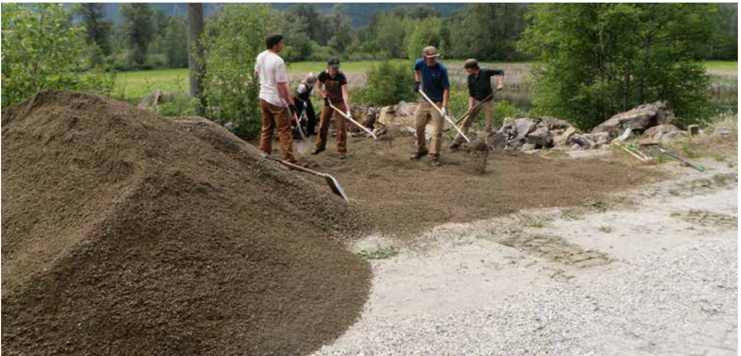
The Nature Trust of Canada, with FWCP funding, spread gravel at a Western Painted Turtle nesting site in the West Kootenay.

In 2009, the Program developed a Strategic Framework that guides the overall planning of the compensation investments (MacDonald, 2009). Subsequent to the development of this Strategic Framework, the Basin and Action prioritization process was initiated in 2010. Specifically, within FWCP Columbia, there is a Basin Plan, which sets forth the strategic direction for the region. In brief, it outlines the vision, principles, policy context and strategic objectives that form the foundation of FWCP Columbia. Beneath the Basin Plan are seven Action Plans (outlined below), which identify a priority-setting process and associated actions. When the Basin and Action Plans are combined, they present the priorities for investments in compensation activities within the Columbia Basin.