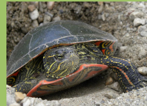
Photo: Western Painted Turtle and wetland habitat work is planned for the North Columbia.

The FWCP is funding nine conservation and enhancement projects in the North Columbia area this year. The total funding is for more than $200,000, and is a three-fold increase over last year following the Board's direction to increase projects being supported in this sub-region. See all the projects being funded in the Columbia Region, including those in the North Columbia, in our Project Summary , or on our map .