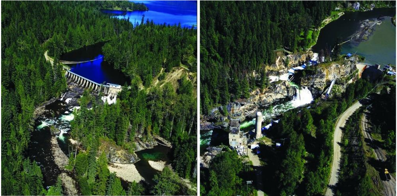
The Fish & Wildlife Compensation Program is conserving and enhancing fish and wildlife impacted by construction of BC Hydro dams in this watershed. From left: Sugar Lake Dam and Wilsey Dam and powerhouse. Cover photos: Coho fry, Western Painted Turtle.