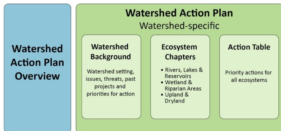
Figure 1: Structure of FWCP Action Plan Overview and Action Plan components.

The FWCP Action Plans provide strategic direction for each region based on the unique priorities, compensation opportunities, and commitments in the region and they reflect FWCP's vision and mission. The Action Plans describe the strategies and Priority Actions to support FWCP objectives. Please refer to the Action Plan Overview for more information on the process that was followed to develop Action Plans. The structure of this Action Plan is shown in Figure 1.