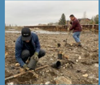
Comox Valley Project Watershed Society

Kus-kus-sum Unpaving Paradise Year 3: This multi-year project on the Kus-kus-sum conservation lands will focus on removing a steel-cladded retaining wall bordering the Courtenay River and restoring a decommissioned sawmill site back to its pre-disturbed state.