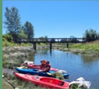
Discovery Coast Greenways Land Trust

Restoring Ecological Function in the Campbell River Estuary: This multi-year project aims to help restore ecological integrity and function in the Campbell River Watershed by managing invasive plants in the estuary, including yellow flag iris, purple loosestrife, and Japanese knotweed.