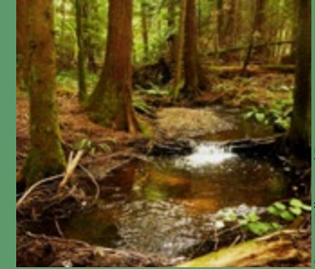
Comox Valley Land Trust

Morrison Headwaters Nature Preserve – Phase 2: This funding will support the Comox Valley Land Trust in efforts to acquire a 289-hectare piece of land to protect valuable habitat in the Comox Valley lowlands, vital habitat for one endangered species and 14 Species at Risk.