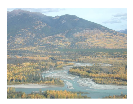
March 10: Restoring connectivity in rivers and streams

Conservation biologist Dan Kraus will explore habitat fragmentation in aquatic ecosystems, and some of the challenges and opportunities of reconnecting rivers and streams.