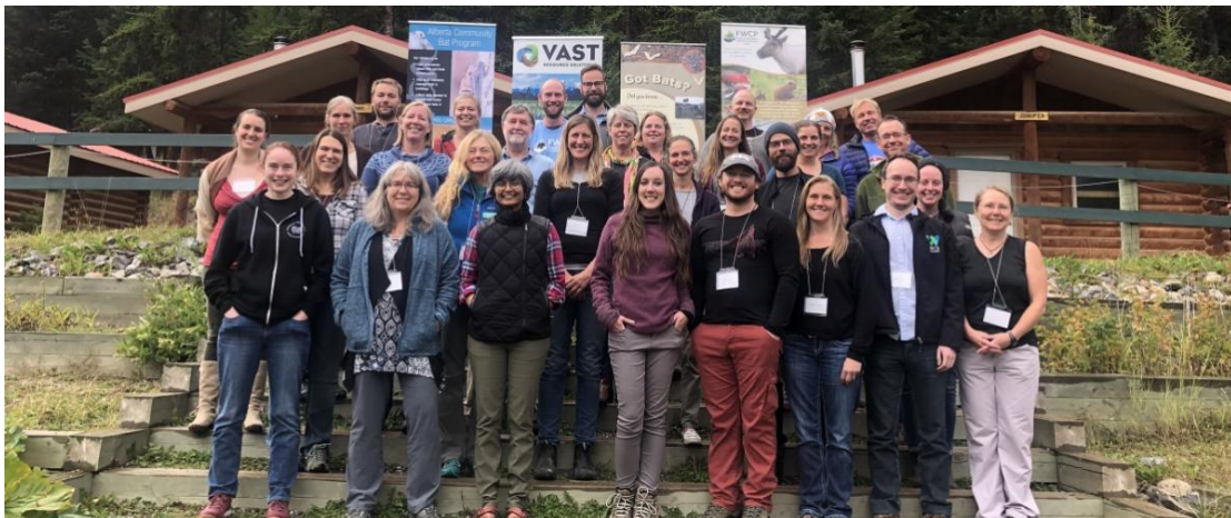
Our Community Engagement Grant helped fund BC's Bat Action Plan.

We can help support your fish or wildlife project. All you have to do is apply for our Community Engagement Grant , you can get up to $1,000, while funds are still available. The application form is short, and we'll make a decision quickly. What are you waiting for? Apply now. We know COVID-19 may impact project delivery, and we appreciate the innovative approaches community groups are adopting to comply with public health guidance. Contact us to discuss your ideas.