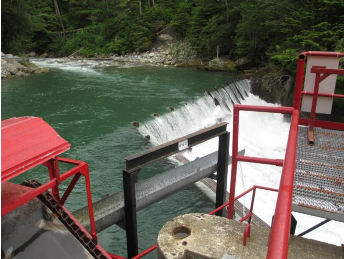
The Fish & Wildlife Compensation Program is conserving and enhancing fish and wildlife impacted by BC Hydro dam construction in this watershed. Above photo: Clayton Falls Creek hydroelectric project, Credit: BC Hydro. Cover photo: Northern Goshawk, Credit: iStock