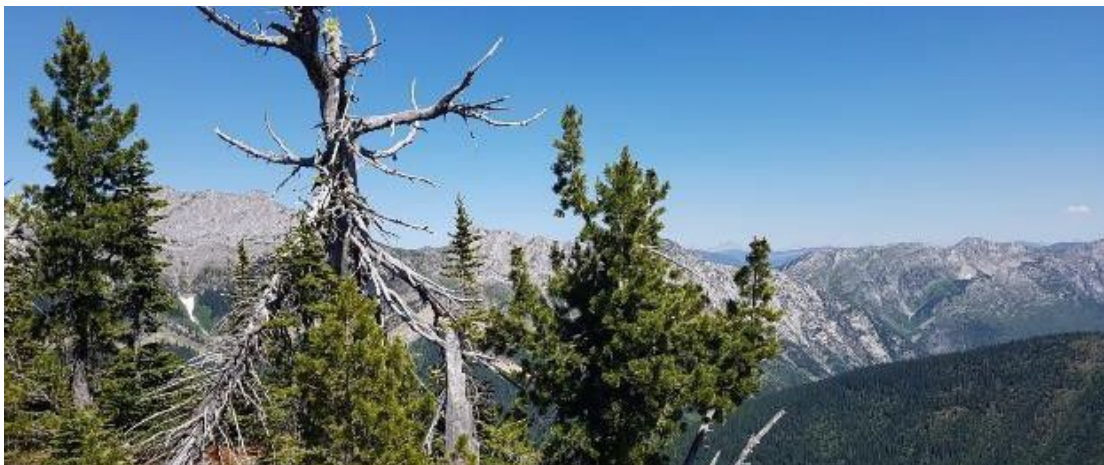
This Whitebark pine project in the Bridge-Seton Watershed is one of 28 projects approved by our Coastal Region board for 2020-2021.

Join our online application info session: Thursday October 1, 1 p.m.-2.30 p.m. RSVP at fwcp@bchydro.com .