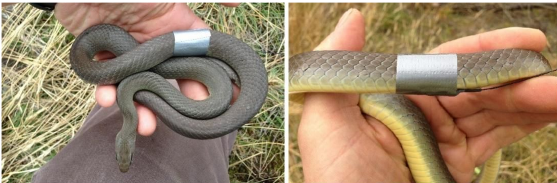
An adult North American racer snake with a radio transmitter attached (left); the transmitter on the snake's ventral (underside) scales (right).