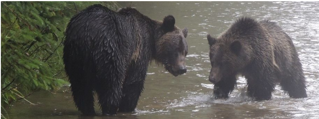
Several projects in our Columbia Region are focusing on helping grizzly bears.

Our Columbia Region board approved approximately $5.5 million for 43 projects for 2020-2021. The 11 fish and 32 wildlife projects will be delivered by stewardship groups, agencies, Indigenous Nations, consultants, and others. Together the projects will restore spawning and riparian areas, improve grassland and upland habitats, assess and monitor populations, conserve wildlife corridors, restore wetlands, and secure lands for conservation. The projects will benefit wolverines, bighorn sheep, bull trout, kokanee, sturgeon, birds, amphibians, bats, and more. Read our 2020-2021 Columbia Region project list . Visit our interactive project map .