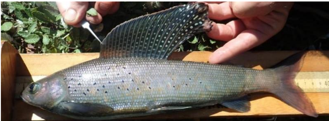
Arctic Grayling is one of many species being supported by FWCP funding in 2020-2021.

We will be announcing our Peace Region's 2020-2021 projects in the next few weeks. Across our three regions approximately $8.7 million was approved for 99 fish and wildlife projects.