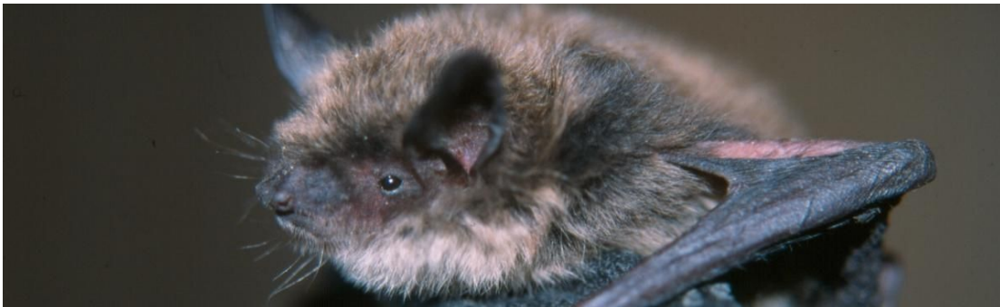
The FWCP recently funded a planning workshop, involving stakeholders from BC and Alberta, to determine priorities for bat conservation. Photo: Little Brown Bat

Deadline for applications is 5 p.m. Friday, October 25, 2019.