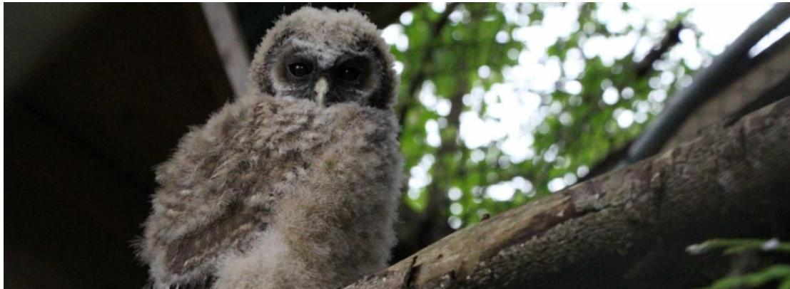
Chick "F", taken in June of this year. Looking for a name!

It's a boy! Chick "F" was one of the first chicks to hatch this past breeding season and helped the Northern Spotted Owl Breeding Program (NSOBP) get into gear for the busiest breeding season yet. He was the star of our nest webcam and was raised by foster parents Skalula and Oregon. Now he needs a name of his own. Suggestions need to start with the letter "F" and can be submitted on the NSOBP Facebook page: facebook.com/nsobreedingprogram .