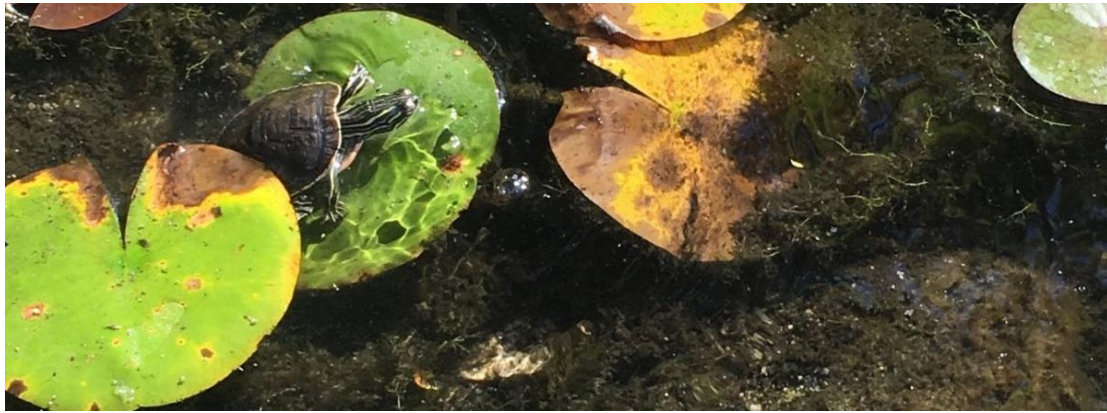
A newly release Western Painted Turtle - part of an FWCP-funded project to help restore turtle populations in the Lower Mainland.

raised in captivity, to increase survival rates. A total of 81 turtles have been released this year in various Lower Mainland locations. Read more about the goals of the project to help the Pacific Coast Population of Western Painted Turtles that is Red-listed in B.C.