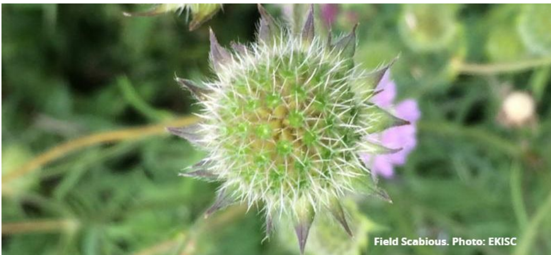
Field Scabious.

The East Kootenay Invasive Species Council (EKISC) is targeting one of the region's priority invasive plants, Field Scabious, along the banks of Sinclair Creek in Radium. With funding from an FWCP Community Engagement Grant , EKISC invite you to learn more about this invasive species, and help with restoration work by digging it up and replacing it with native plants. Read more.