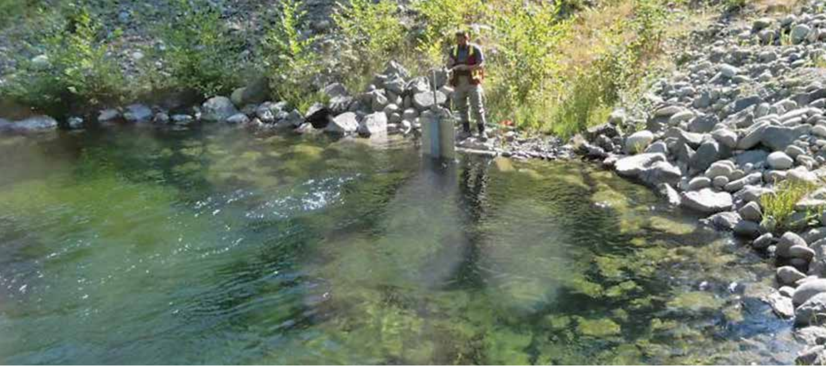
Intake pool at the Big Tree Side Channel.