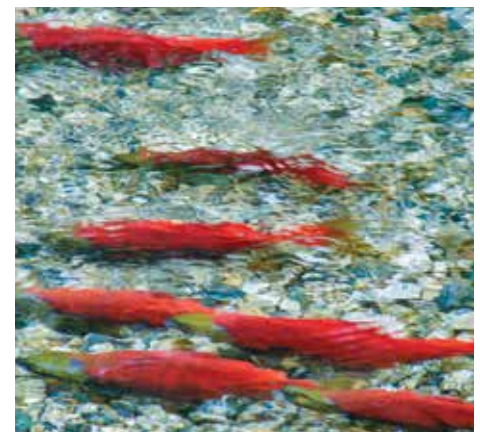
Above: spawning kokanee.