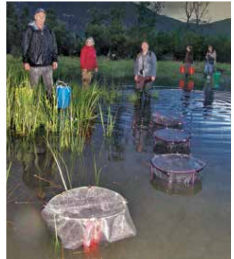
Release day in the Columbia Marshes.

The FWCP also supplies tadpoles annually to the Vancouver Aquarium to support