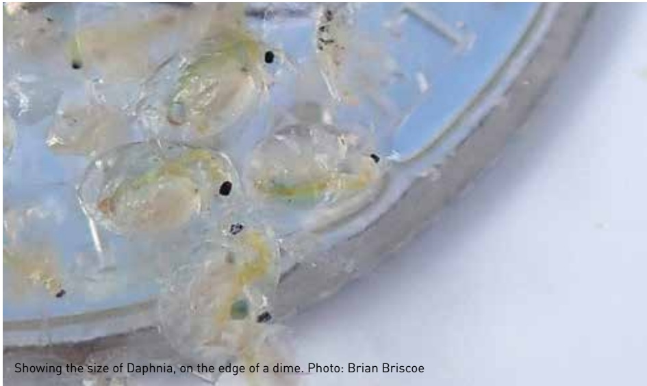
Showing the size of Daphnia, on the edge of a dime.

The zooplankton in Kootenay Lake are doing exceedingly well. If not “off the charts,” then it would be accurate to say the charts have been dramatically extended to accommodate the numbers. In 2013 in the North Arm of Kootenay Lake (where the FWCP and BC Hydro are the primary funders for nutrient additions), the recorded annual mean biomass (weight) of Daphnia was 2.6 times higher than the previous high in 2003. Daphnia is a type of zooplankton and the preferred food source for kokanee.