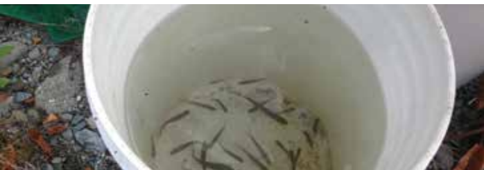
Freshwater recovery bucket.

“By creating a new channel and adding stable water flows year-round we have created new summer rearing and safe overwintering habitat for Coho and other species,” says Jeremy Damborg, project biologist with the BC Conservation Foundation, one of several partners in this important project. Damborg adds the stable water flows have re-watered existing braided habitat downstream that would otherwise be dry providing up to 10,000 m 2 of additional high value habitat and 9,350 m 2 of rearing and spawning habitat.