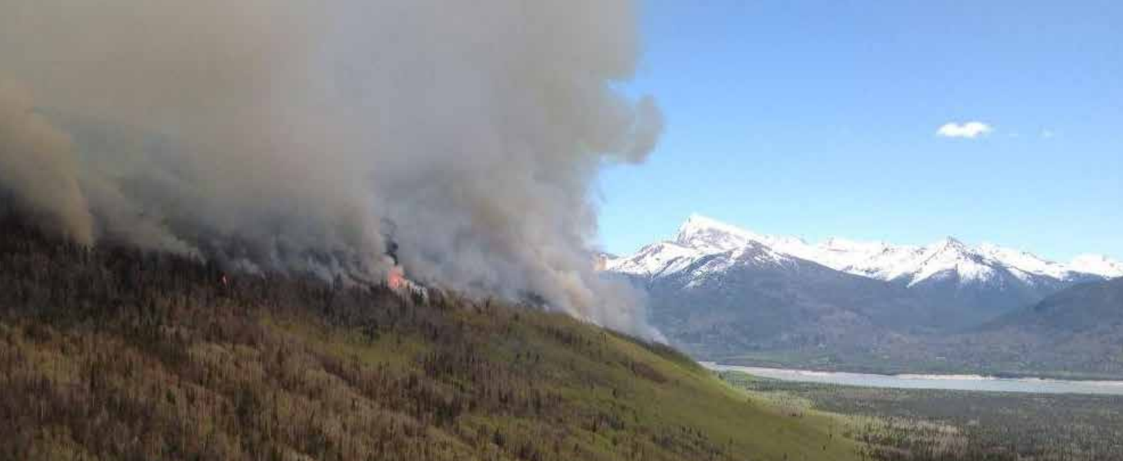
Prescribed burning near the Williston Reservoir.