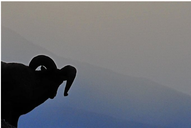
Bighorn sheep.

Click on any of the stories below to read more.