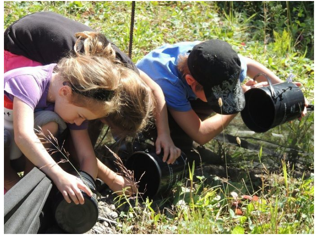
Making sure that every last toadlet is safely released from the buckets!