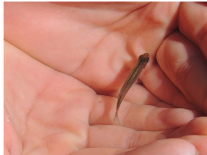
$5 million in planned project spending this year. No Small Fry!