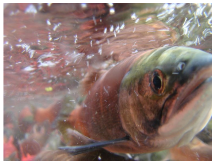
Meadow Creek Spawning Channel: New Hours and Open House