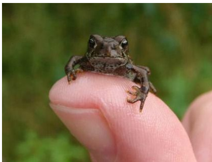
Toadfest 2013 This Week!