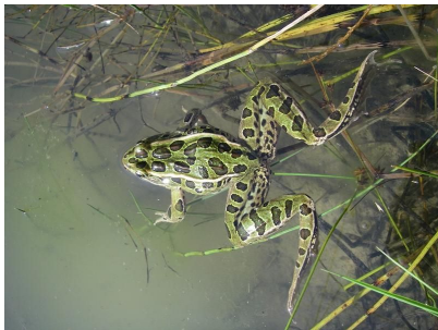
Great News on the Northern Leopard Frog Front