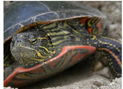
$3 million Committed to Kooecanusa Area Fish and Wildlife