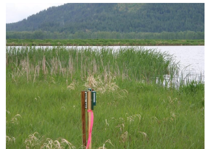
FWCP Wins Song Contest!