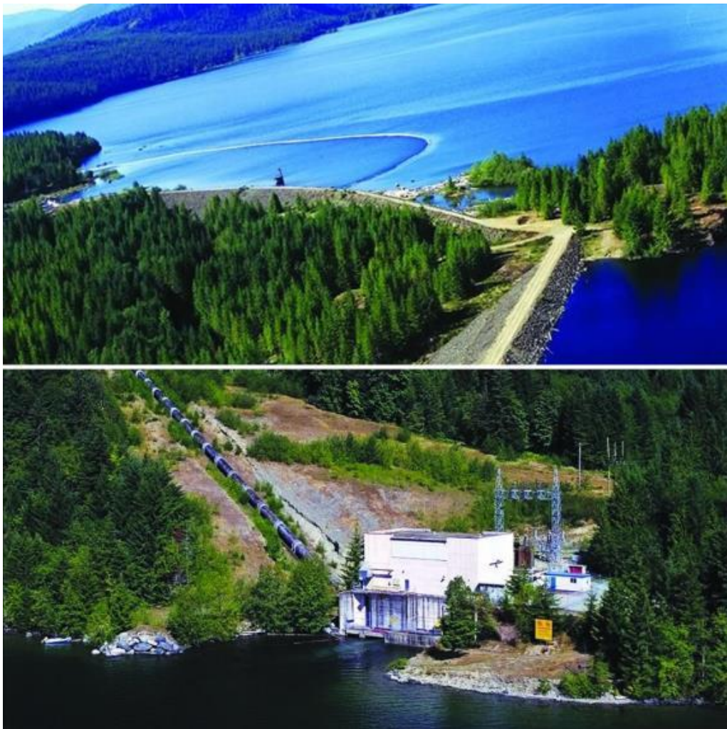
The Fish & Wildlife Compensation Program is conserving and enhancing fish and wildlife impacted by BC Hydro dam construction in this watershed. Photo from top: Elsie Lake Dam at Elsie Reservoir; and Ash Generating Station at Great Central Lake, Credit: BC Hydro. Cover photo: Steelhead, Credit: NOAA.