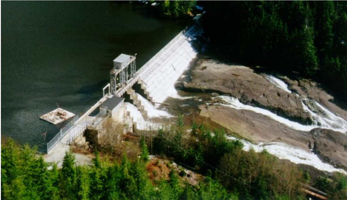
The Fish & Wildlife Compensation Program is conserving and enhancing fish and wildlife impacted by BC Hydro dam construction in this watershed. Photo: Falls River Dam on Big Falls. Cover photo: Coho.