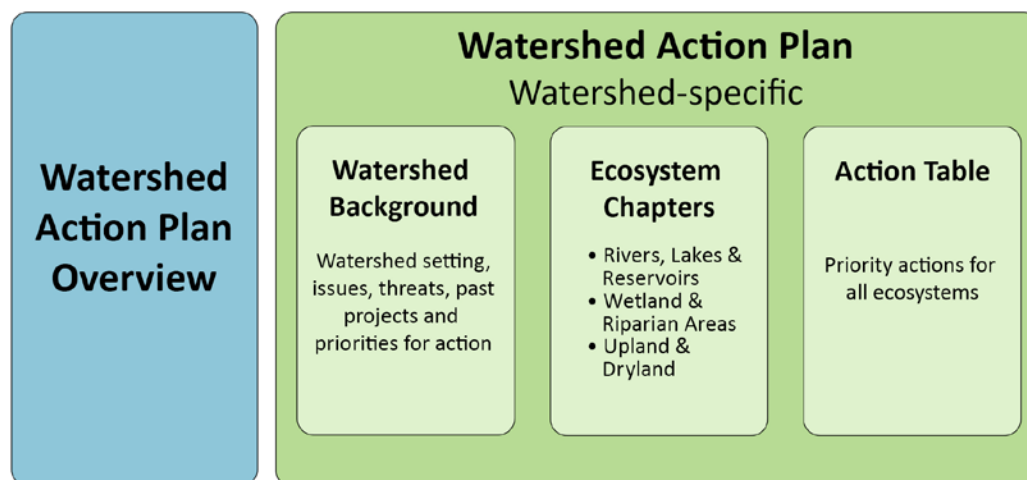
Figure 1: Structure of FWCP Action Plan Overview and Action Plan components.

The FWCP Action Plans provide strategic direction for each region based on the unique priorities, compensation opportunities, and commitments in the region and reflect FWCP's vision and mission. The Action Plans describe the strategies and Priority Actions needed to support FWCP objectives. Please refer to the Action Plan Overview for more information on the process that was followed to develop Action Plans. The structure of this Action Plan is shown in Figure 1.