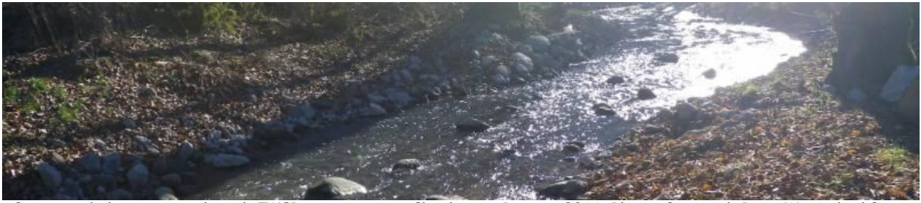
Spawning habitat created, with FWCP support, near Cheakamus River in 2014